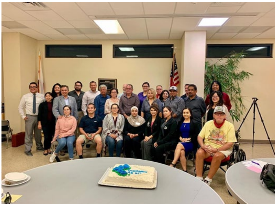
Caption: Approval of the CERP by the CSC, October 2, 2019 (Heber, CA)

The CSC adopted the CERP for the El Centro-Heber-Calexico Corridor on October 2, 2019, and subsequently the Air District Board (Imperial County Board of Supervisors) approved the Plan on October 8, 2019. On November 13, 2019, CARB Staff held a public workshop at Imperial Valley College (Imperial, CA) to present and discuss the objectives and strategies of the CERP. The public took this opportunity to share their opinions on the CERP, and the overall AB 617 Program/CAPP, which CARB recorded as the agency reviewed the CERP prior to CARB Board's consideration of the Plan. On January 15, 2020, at a special public meeting held in El Centro, CA, the CARB Governing Board considered and voted to adopt the CERP for the Corridor.