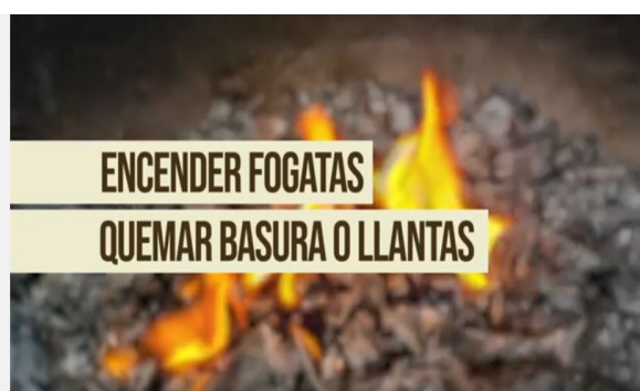
Caption: Screenshots of television ad as part of "Ambientalizate,"

4. The fourth and final interim milestone directs CARB staff, ICACPD, and CCV to continue developing support strategy and design a process that defines a schedule and appropriate lead time to allow the CSC to review documents, ask questions, and provide feedback.