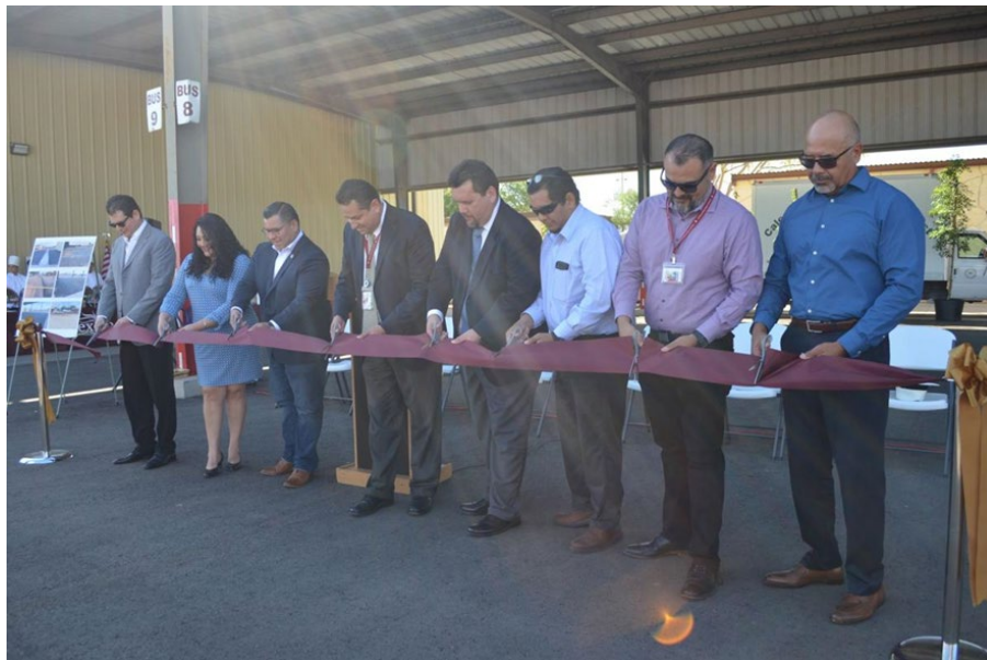
Caption: Ribbon Cutting Ceremony for Calexico High School Paving Project, October 4, 2019

As an early emission reduction project, the Air District completed a parking lot paving project at Calexico High School (Calexico, CA) in late 2019. The project consisted of paving the bus and staff parking lots at the Maintenance and Operations building at Calexico High, which results in an annual PM 10 emission reduction of 2.26 tons/year. For details, please refer to Appendix A.