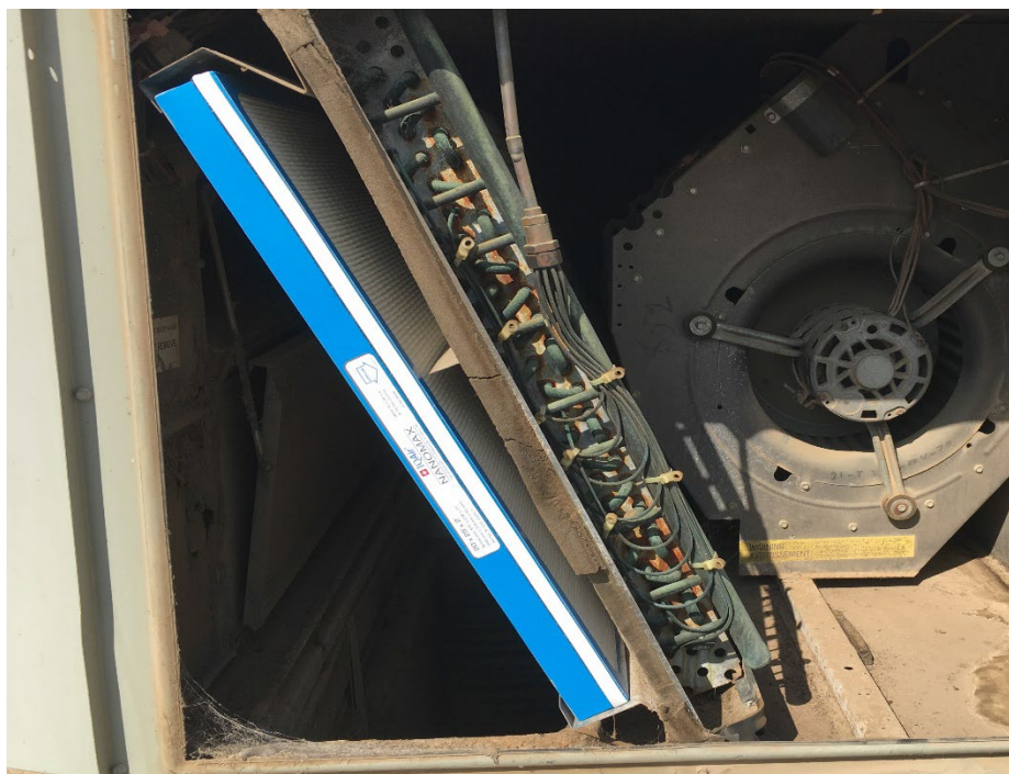
Caption: HVAC unit with IQAir High Performance Filter (Heber School, Heber, CA)

The final mitigation strategy included in the CERP is the installation of air filtration systems (systems) at sensitive receptor locations such as schools in the Corridor. It has been demonstrated that these systems significantly reduce concentrations of particulate matter (diesel and fugitive dust) and other pollutants in the indoor environment. The Air District has moved forward with implementation of installing air filtrations systems at schools in the Corridor, based on the input received from the CSC in 2019, with the air filtration company IQAir North America, Inc. (IQAir). IQAir has installed air filtration systems throughout the corridor, starting with Dogwood Elementary School (Heber, CA) (leveraged funds used) and Heber School (Heber, CA) (leveraged funds used). There is a total of 2 schools in Heber, 12 schools in Calexico, and 16 schools in El Centro. IQAir has installed 2 systems in Heber, 10 systems in Calexico, and 10 systems in El Centro as of September 2022. These systems will benefit receptors (students & staff) at all those locations. The Air District will continue working with IQAir to schedule site assessments and air filtration installations at schools, utilizing AB 617 funding and other funding mechanisms to leverage existing allocated funds for this strategy. For additional details, please refer to Appendix A.