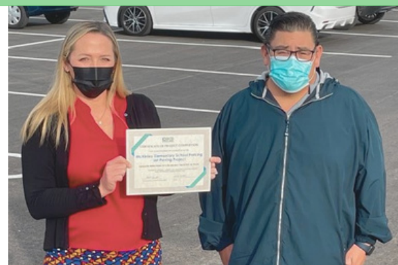
Rule 310 Paving Certificate Presentation McKinley Elementary School (El Centro)