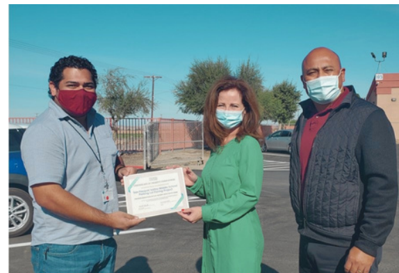
Rule 310 Paving Certificate Presentation San Pasqual Valley Unified School District

Valid air quality data is essential in demonstrating where and how an area is attaining or not attaining its air quality goals and improvements. Monitoring achievements include in house calibrator training, whereby the ICAPCD is no longer reliant on outside sources for calibrating equipment to federal and state standards. Both the Niland and Westmorland stations have undergone Ozone instrument improvements that assure with greater accuracy the concentrations of Ozone. The Air District is exploring the potential use of advances in computer design and mapping to illustrate densities in air emissions, such as the Air Quality Index, as a supplement to air alerts.