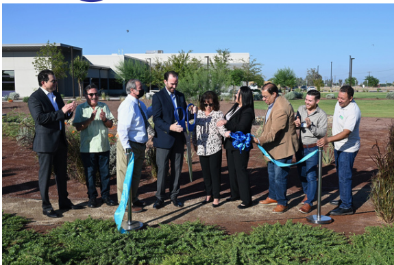
AB 617 Urban Greening Project at ICOE West in El Centro, CA October 17, 2022