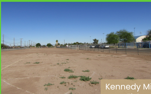
Kennedy Middle School El Centro, CA (Paving Project)