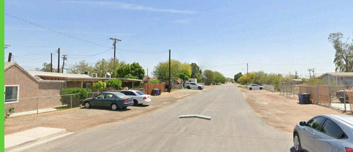
East 7 th Street at Heber Avenue, looking east