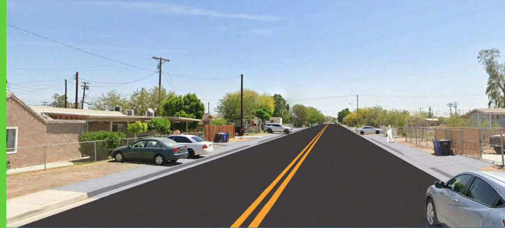
East 7 th Street at Heber Avenue, looking east