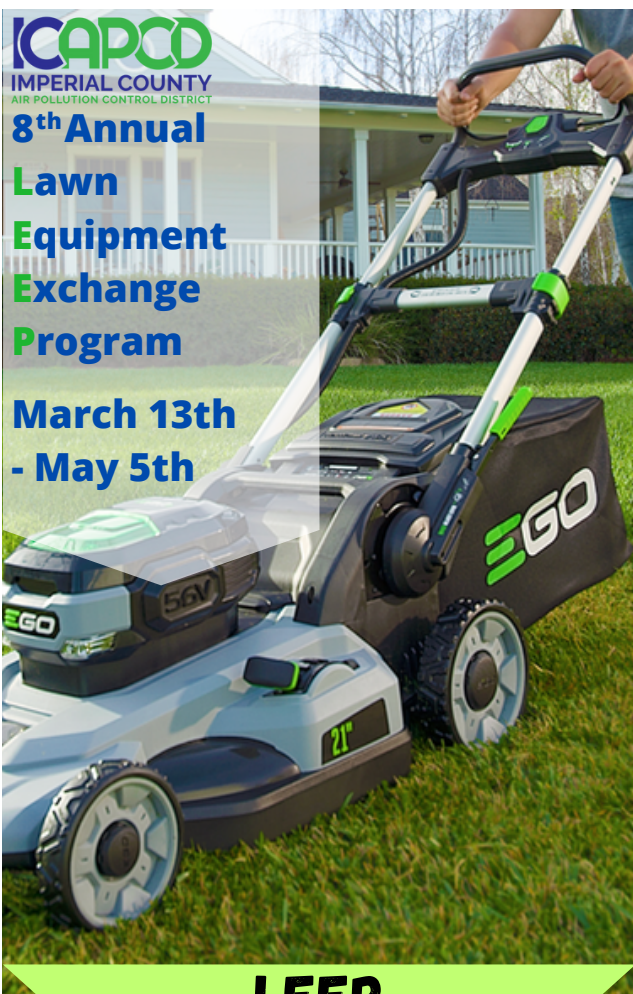
ICAPCD IMPERIAL COUNTY AIR POLLUTION CONTROL DISTRICT 8th Annual Lawn Equipment Exchange Program March 13th - May 5th