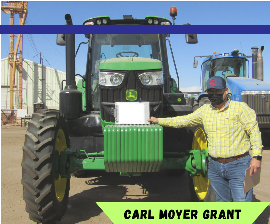
CARL MOYER GRANT ENGINE REPLACEMENTS

The Grants staff continues to work with local agricultural businesses on diesel engine replacements. Staff began the Lawn Equipment Exchange Program on March 13th for the general public (see our website for more details). The Air District continues working with local agencies on paving projects to reduce dust emissions through the CAP CARB grant.